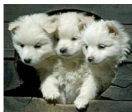
Kerberos as a puppy.